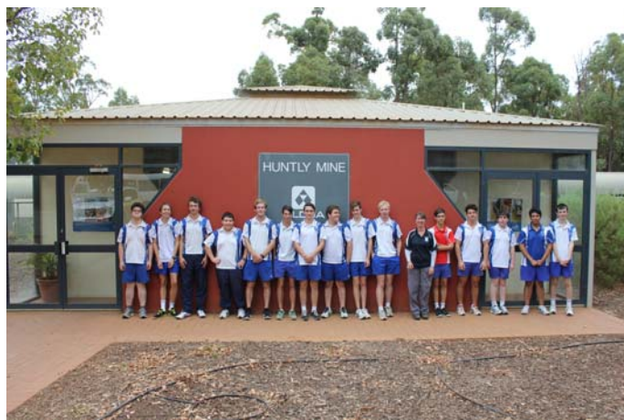
Year 12 Earth and Environmental Science students at the Alcoa Bauxite Mine