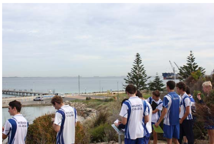
Year 12 Earth and Environmental Science students studying the coastal ecosystems at Rockingham.